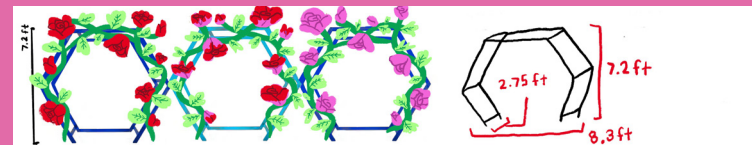
Artist rendition of the Armstrong Rose Arches.

The overall design of this year's Ontario Arts Festival installations is inspired by the arts and culture of our local history, and in Ontario, "culture" has often meant agriculture.